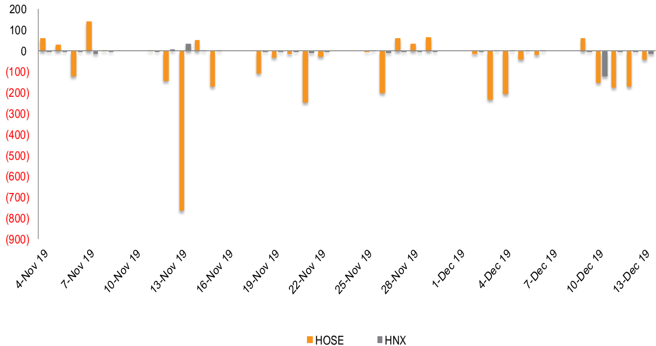
Foreign net buy/sell (30 days) in VND'bn